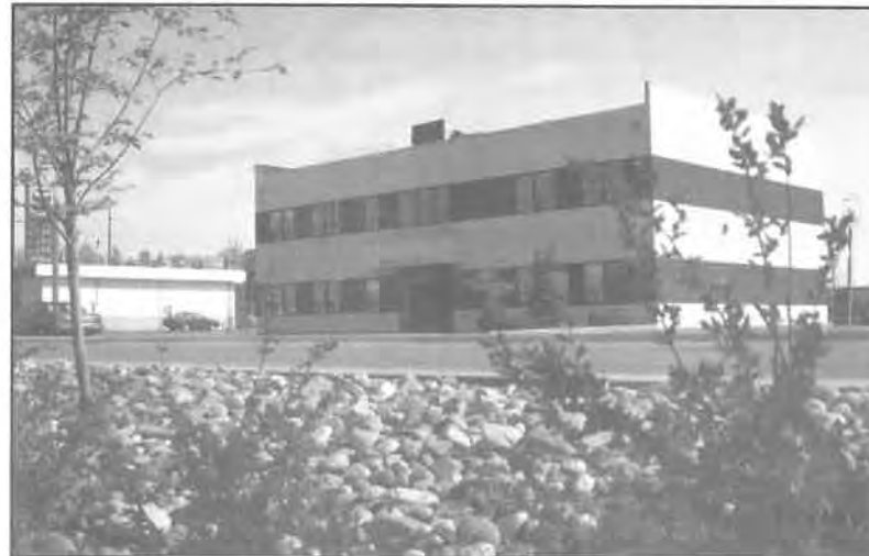
Lumen Christi High School's new home is located at 750 E. Fireweed Lane.

After a year and a half of planning, searching and wondering if it was really possible, Lumen Christi High School opened its doors on Sept. 3 to students in grades 7 through 10. Grade 11 will commence in the fall of 1997, followed by grade 12 the next year.