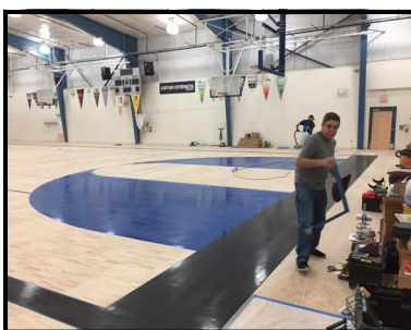
Following months of planning and expert craftsmanship, our new gym floor is complete! While this project has had its share of frustrating moments, the end result is absolutely beautiful. Hopefully, no more earthquakes for awhile!