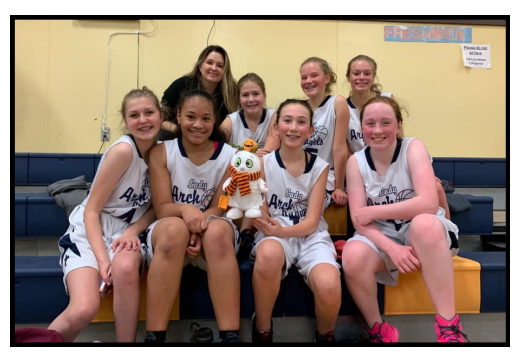
Our Lady Archangels basketball team.